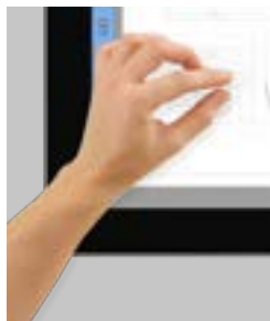
Touchscreen Full HD 21.5" touchscreen