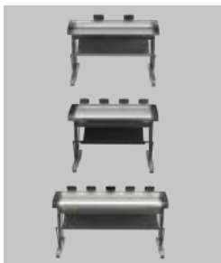
Your choice of scanner IQ Quattro X 44 inches HD Ultra X 42 inches HD Ultra X 60 inches